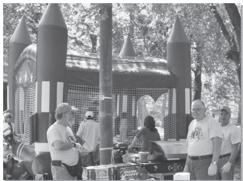
The Tysons Lions Club serving lunch at last year's Pimmit Hills Day.

Calling all Residents, Alumni, Businesses & Organizations: