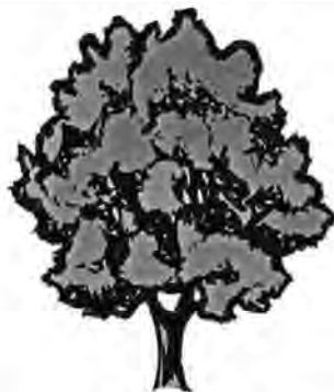
Pimmit Hills Your Community

It's time to renew your yearly membership in the Pimmit Hills Citizens Association. Membership is still a bargain at only $3 per person. Your support of your community helps the PHCA to have a stronger voice with the government of Fairfax County. Important: the information you provide below will be incorporated into the next PHCA Directory. Please be sure it is accurate.