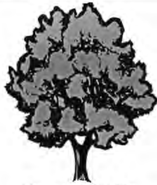
Pimmit Hills Your Community

It's time to renew your yearly membership in the Pimmit Hills Citizens Association. Membership is still a bargain at only $3 per person. Your support of your community helps the PHCA to have a stronger voice with the government of Fairfax County. Important: the information you provide below will be incorporated into the next PHCA Directory. Please be sure it is accurate.