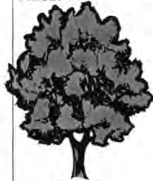
Pimmit Hills Your Community